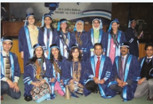
Class of 1997-2002 at Convocation