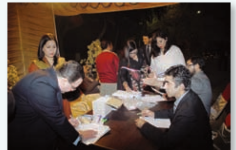
Reception desk at first AIMC alumni night in Lahore. Almost 400 local alumni participated in the occasion.