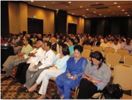
AIMCAANA social forum participants with Maleeha Lodhi.