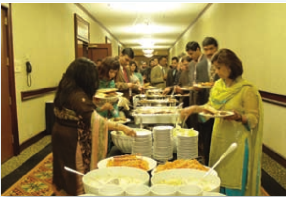
Dinner was actually served at the 13th Annual Alumni get together.