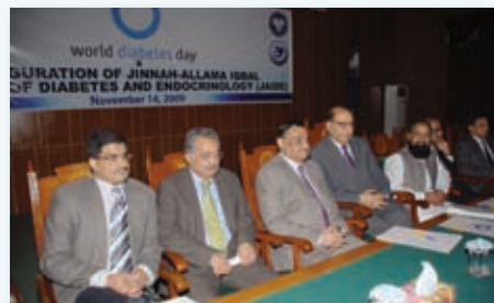
JAIDE Inauguration Ceremony, November 14, 2009.