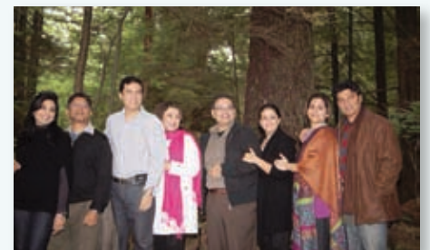
Iqbalians on APPNA Alaska Cruise