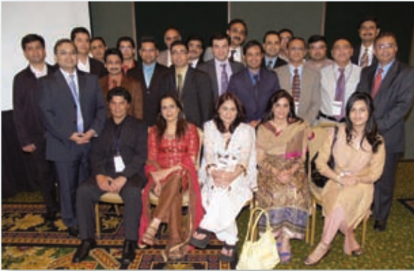
Iqbalians at the 13th Annual Alumni Dinner in San Francisco.