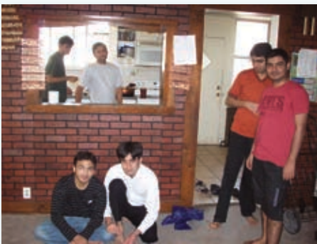
Boys at Iqbalian House in Upper Darby, Pennsylvania.