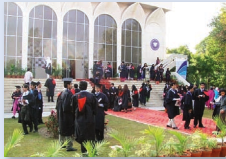
AIMC 8th Convocation 2006