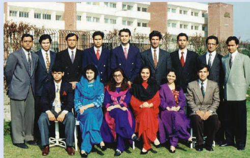
AIMC Class 1995