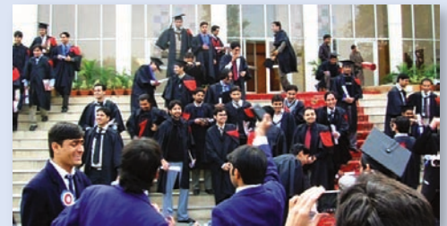
Iqbalian's at 8th Convocation 2006