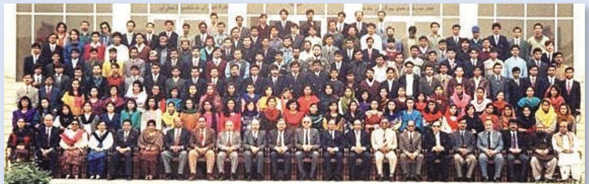
AIMC Class Group Photo 1995