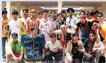
AIMC Class of 2001