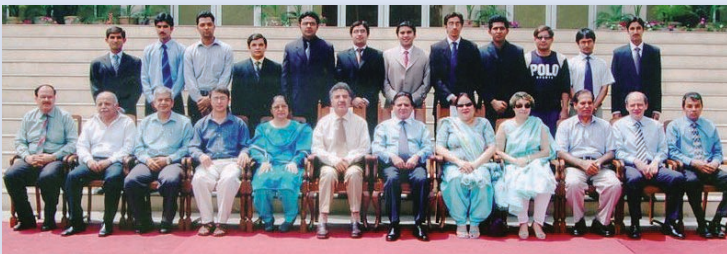
AIMC Class 2006