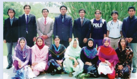
AIMC Class 2006