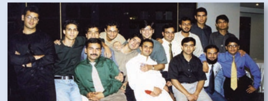
AIMC Class 2003