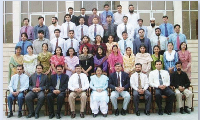
Jinnah Hospital Medical Unit 1 August 2004