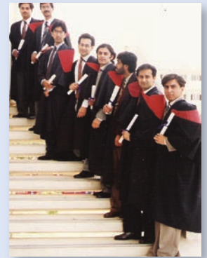
AIMC Class 1992