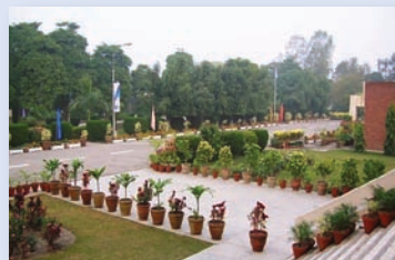
Two views of the most beautiful college in Pakistan