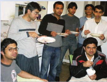
Iqbalian's House Post Match Party