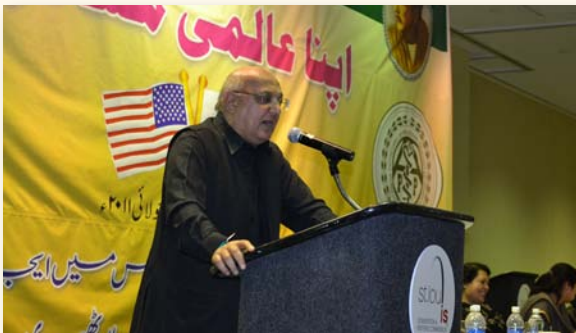
Amjad Islam Amjad