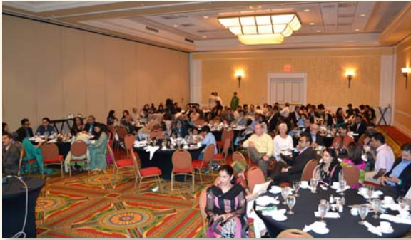
2011 Alumni Dinner