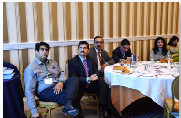
Iqbalians holding the fort