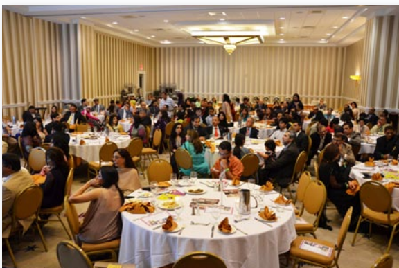
Iqbalian families at the annual dinner in Washington DC